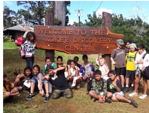
Keiki in front of KDCAI sign

While we recognize the gift of time, we also acknowledge that it comes with a less positive side. Too much time can lead to a lack of urgency, producing complacency and an accountability vacuum. In this past year, for example, we came to see even more vividly the very real threat that Rapid 'Ōhi'a Death poses to our native 'ōhi'a trees on Hawai'i Island and perhaps throughout the entire island chain. We see children growing up in Hawai'i without a strong connection to the 'āina and lacking an understanding of their role in caring for the resources that feed and sustain all life in the islands. Have we waited too long to address these issues?