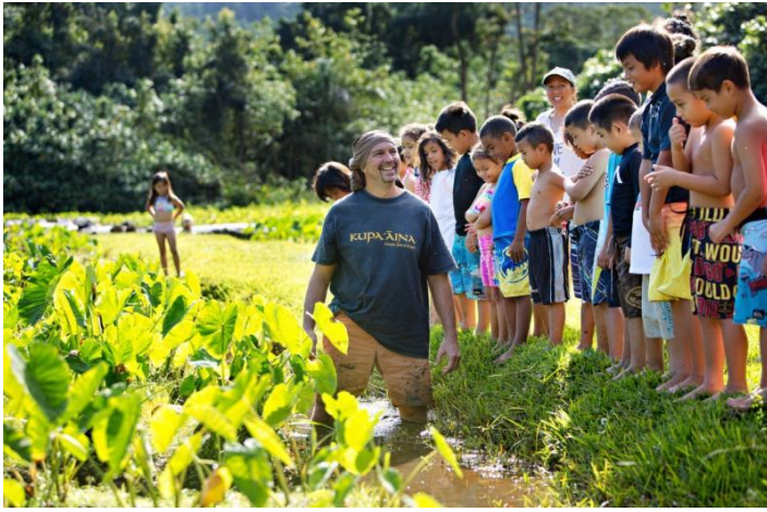
Hope for Kids 'Elua

approaches to addressing it. Yet at the same time, we feel a sense of urgency - if we don't act now we'll lose the chance to protect our native ecosystems or to educate a whole generation of children in ways that connect them to their natural world and help them see their place within it.