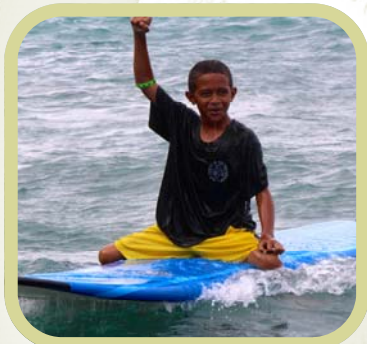
A first year haunama of the after-school program practices wīwo'ole (having the courage to do something you are not used to doing) by catching his first wave and riding it all the way to the shoreline of Kaupō.

'Ohana: I feel like the kids would benefit greatly from starting the program a year earlier, because they're so readily influenced at this age. If they have exposure to more role models and peers, it would go a long way for their development.