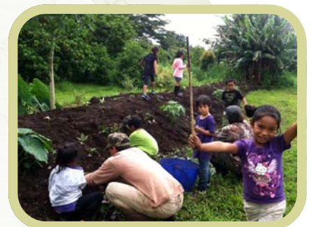
The Mabele Farm crew teaching Hana keiki how to plant edible food crops.

As external evaluator, Pacific Resources for Education and Learning (PREL) was asked by the Foundation to work with the Partners to develop an outcome evaluation in line with the Foundation's Core Elements and desired outcomes. The evaluation focused on fully developed programs or subprograms and on participants who had received a sufficient amount of program time to experience the full benefits of participation.